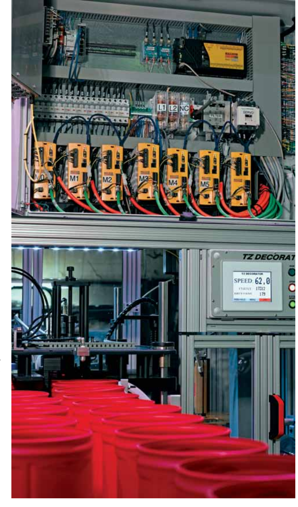
Baldor's NextMove e100 real-time Ethernet motion controller communicates with seven Baldor MicroFlex e100 servo drives to create seven axes of motion in this application. This digital solution reduces the wiring between the drives and the motion controller, improving set up time and increasing reliability. These products were selected because they are easy to install, and user-friendly, and they offer the precise performance required in this unique application.

"The system is sophisticated in the way that all seven axes are moving at the same time to control the paper and wax label and the container," says Ziegler. "The paper label itself is floating on a layer of wax, which is heated up just enough to get the wax to liquefy. Then, right at the point when we apply it to the container, we heat the adhesive up a little hotter so it adheres to the container."