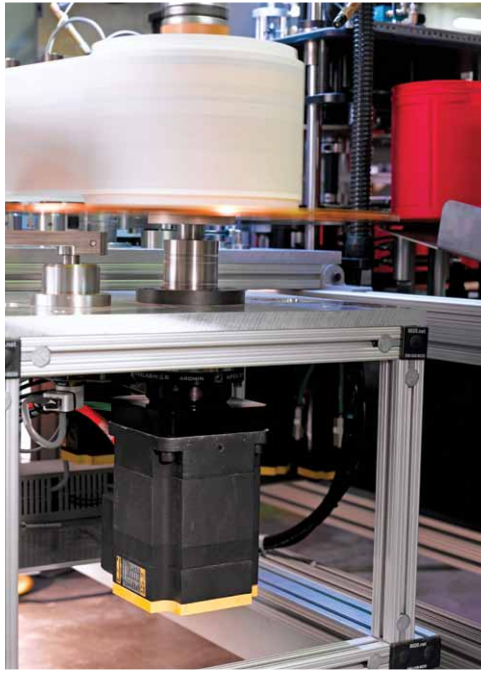
Baldor motion control products are programmed to provide the right feed, placement and pressure for the machine to apply heat transfer labels from a preprinted, continuous paper web to the container. This new equipment has helped the end user become more efficient by taking its scrap rate of 7% at 50 containers per minute to less than half of 1% at 60 containers per minute.

Ziegler. "Plus, Baldor offers the software for free and provides free upgrades via the Internet – that's a huge benefit to both me and the customer. Others have tried to get my business, but I continue to use Baldor motion control products because it's a much easier package to work with, the products perform, and they are reliable."